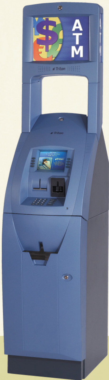
9700 WITH BACKLIT HIGH TOPPER

Triton's 9700 Series ATMs are the perfect low-cost solution for today's retail ATM market. These sleek, new machines offer legendary Triton reliability at an unbeatable price. • When you factor cost of maintenance, Triton products offer the lowest cost of ownership of any ATM in their class. To further offset costs, the 9700 offers a full slate of advertising features including an optional full-motion video topper that provides the potential for an additional revenue