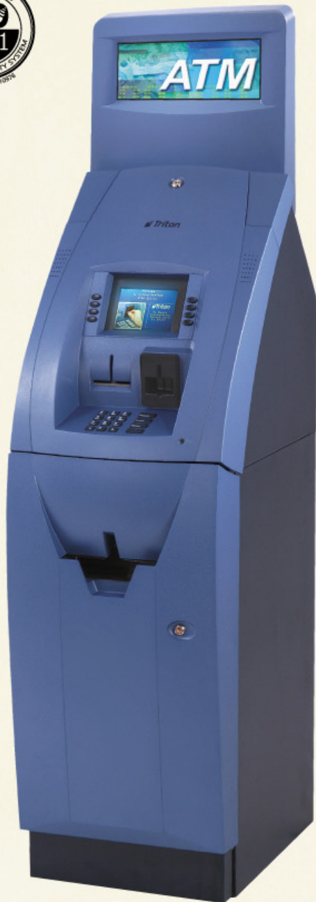
9700 WITH BACKLIT TOPPER